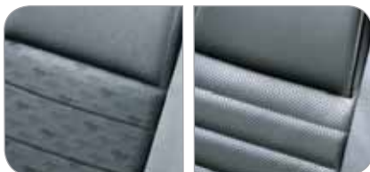
GT CLOTH Stamping Horse Pattern