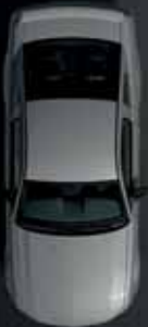
Vapor Silver Metallic