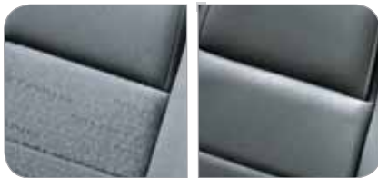
V6 CLOTH MUSTANG Pattern