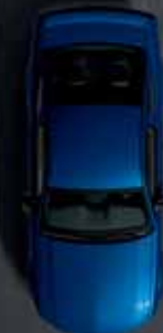
Vista Blue Metallic