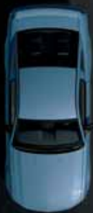
Windveil Blue Metallic