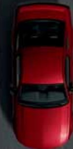
Dark Candy Apple Red Metallic